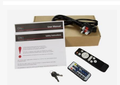
13 Amp Mains Plug, Remote Control, Keys & User Manual

Terms & conditions apply please see our website for full details.