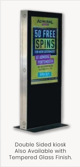
Double Sided kiosk Also Available with Tempered Glass Finish.